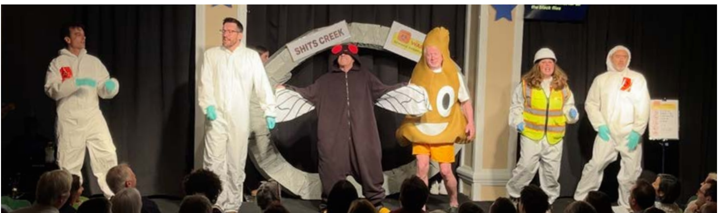
"Backed Up Crap"