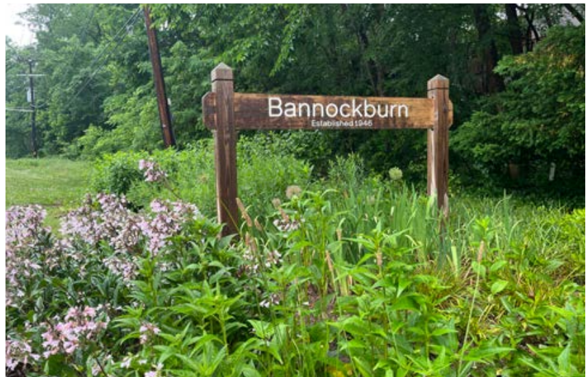
Your BCA dues helped pay for this garden and welcome sign at the corner of MacArthur Boulevard and Bannockburn Drive.

The BCA thanks all our members who continue to patronize local businesses and generously donate to community resources including the Bannockburn Clubhouse, NAN, Glen Echo Park, and Clara Barton Community Center. They help make Bannockburn a great place to live.