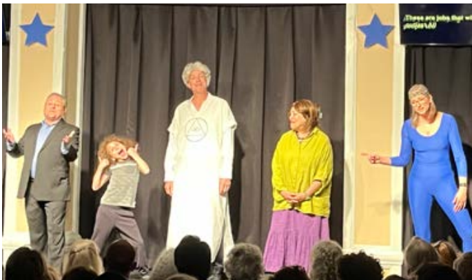
"People In Your Neighborhood"