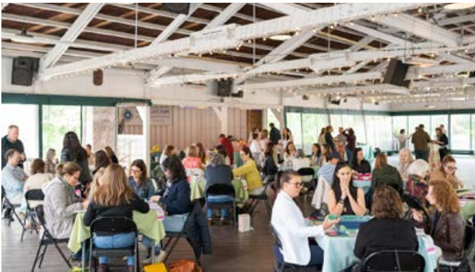
Mahjong in the Bumper Car Pavilion.