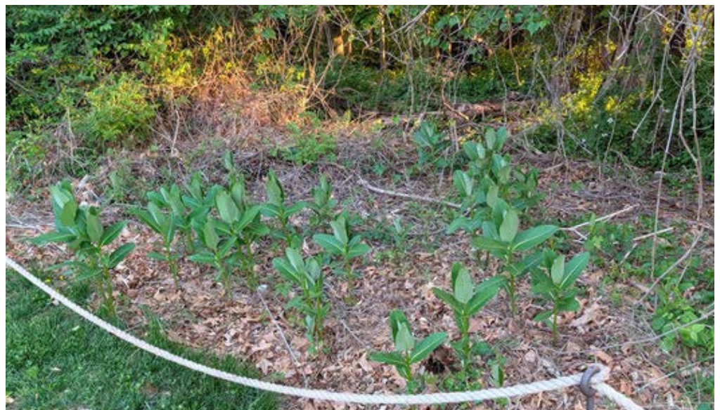
A patch of milkweed sprouting in the woods at BES that was rescued from porcelainberry.