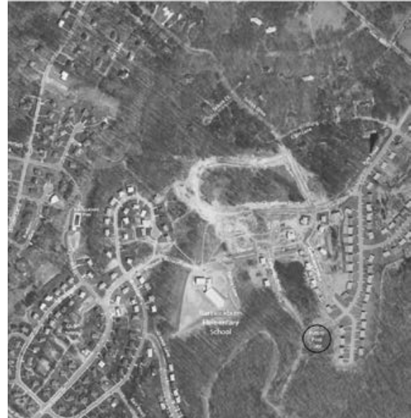
Aerial photo of Bannockburn, 1957.

newsprint, be sure to access the document using the largest screen available. Unless you're a masochist, don't even bother using your phone.