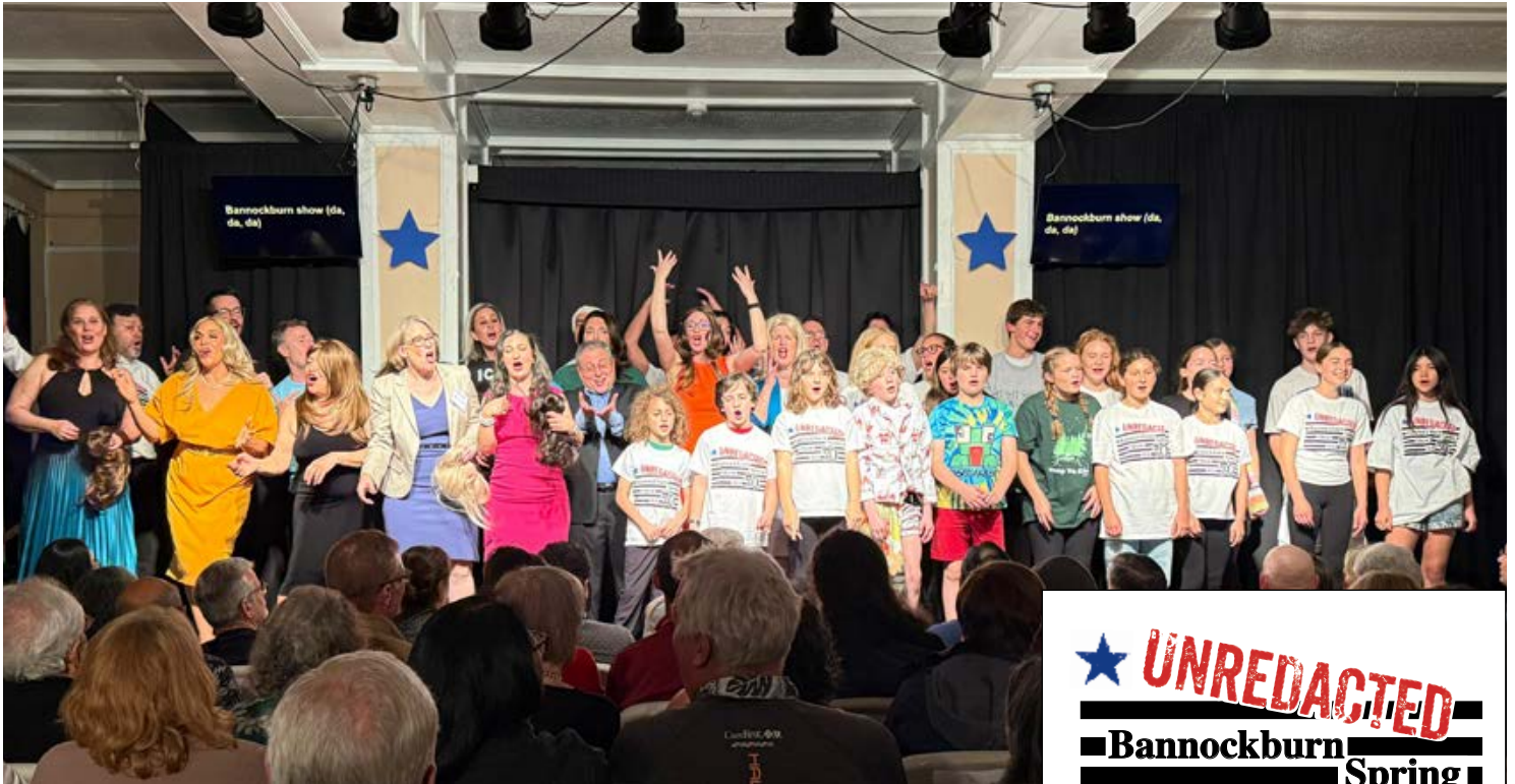
Closing song, Spring Show 70.

The Bannockburn Spring Show celebrated its 70th year. Six shows were performed at the Clubhouse including two matinees. Six hundred eighty-four tickets were purchased raising $22,014 for the Bannockburn