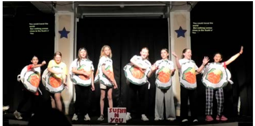
A sneak peek of this year's show with caption monitors.

The Spring Show has long fostered Bannockburn's community spirit. The show recognizes the dozens of volunteers who helped with tasks like ushering, lighting, videography, and stage management; and those volunteers who