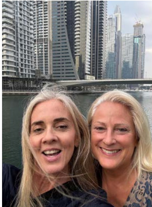
Meeting in Dubai during a war.

Finally, we were back in the air, and when the tracking showed us leaving Egypt and out over the Mediterranean, I breathed a huge sigh of relief. I really hadn't realized how much stress/anxiety had built up in me during my time in Dubai until it dissipated. A quick transfer through Madrid to Malaga, and I was reunited with an old friend of mine with palpable appreciation. Lesson learned — don't fly into a war zone