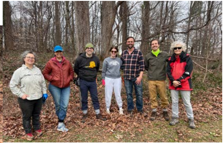
BCA Woodlands Stewards work group at Bannockburn Elementary School, March 15 th .