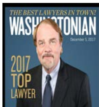
Washingtonian Top Civil Defense Lawyer 2005 -2017