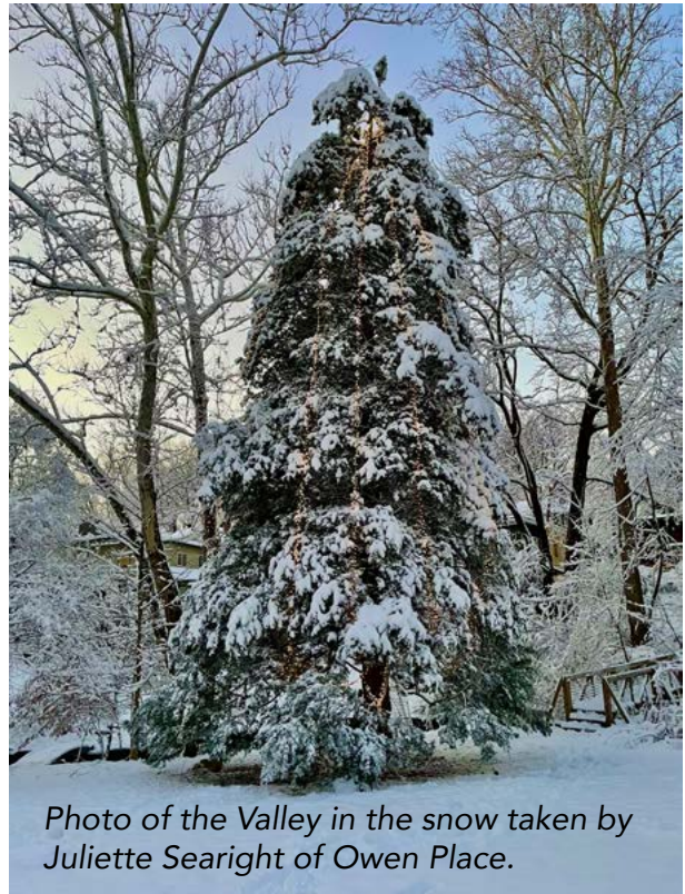
Photo of the Valley in the snow